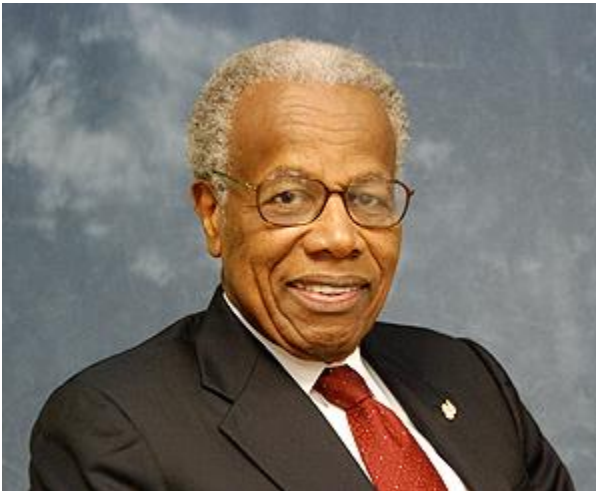
Johns Hopkins University.